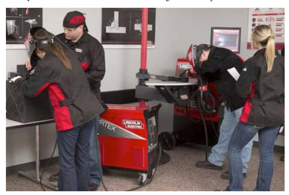
Training with the Lincoln VRTEX 360

The Lincoln Electric VRTEX 360 is a virtual reality training system that enables welders to be trained better, faster and at lower cost. As an interactive welding simulator it uses a welding gun and helmet connected to a CPU about the size of small generator. The helmet includes speakers and 3D goggles, through which the trainee sees a virtual welding gun and work site, such as a high-rise or welding booth. Speakers in the helmet broadcast the tell-tale pop and sizzle of materials being melted and joined.