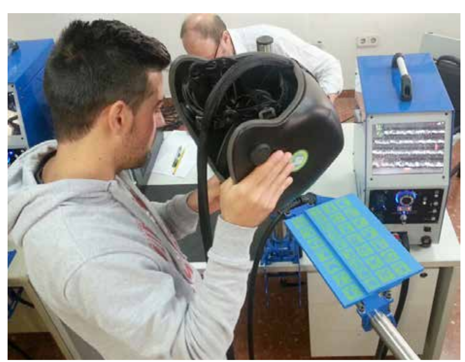
Soldamatic Augmented Training – not just a trainer-simulator for welding but a comprehensive educational solution

With up to 180 systems already in service in over 25 countries, Marquinez highlighted the value of remote maintenance and customer service which the company provides in real time worldwide. The website is also utilised to deliver customer care to end users and distributors, while applications for smartphones and tablets appeal to younger generations and aid in the recruitment of students to training