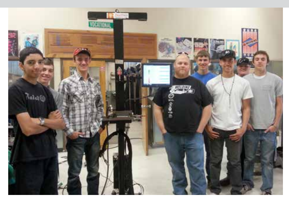
A welding class in the USA utilises the RealWeld Trainer to give real-time feedback on live welding using standard welding machines and procedures, as well as practice welding with the arc-off

real time, allowing immediate correction of technique.