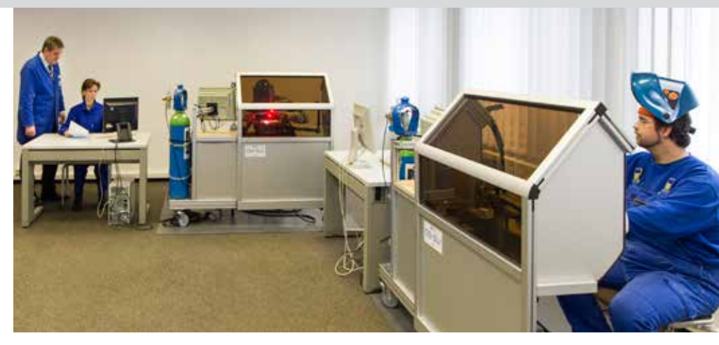
The GSI SLV Welding Trainer combines elements of hands-on education of welders and computer-based simulation to educate welders as realistically as possible